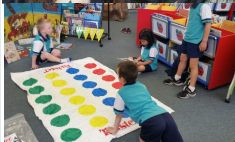
It's always fun and games in the library during second lunch!!